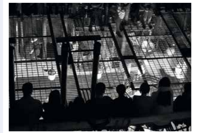
Dog House. View from above. View from below.. performance exchange 2017