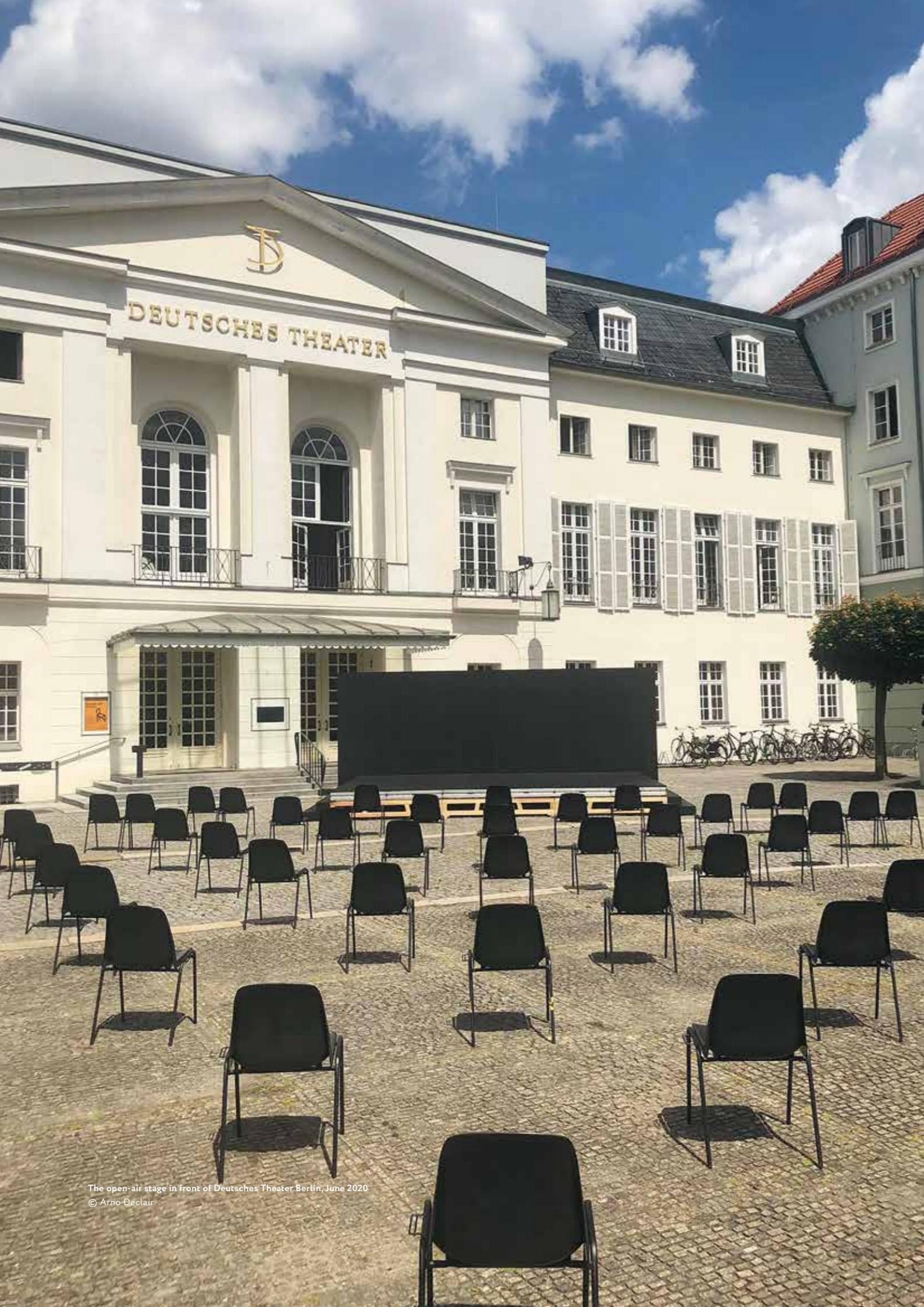
The open-air stage in front of Deutsches Theater, Berlin, June 2020