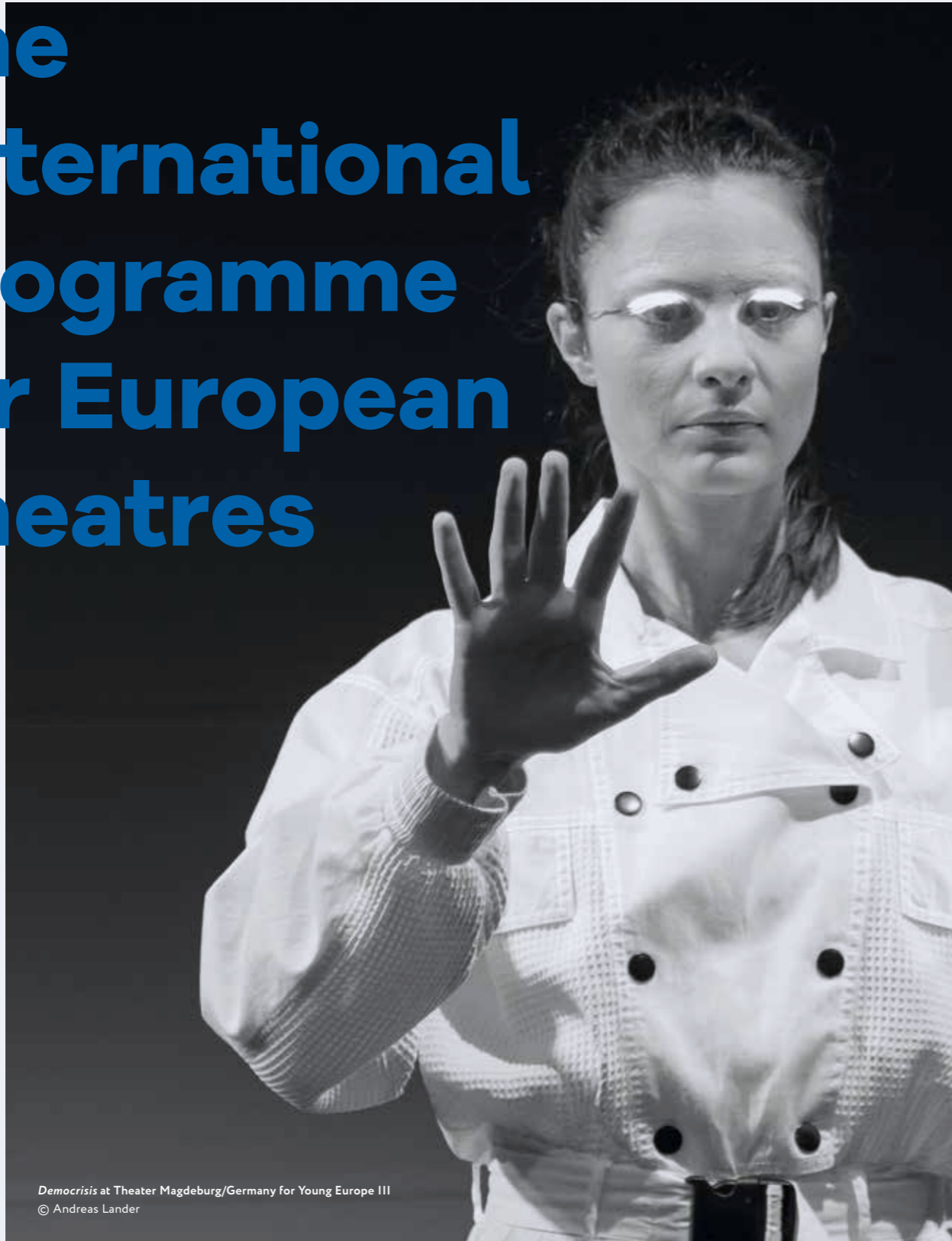
Democrisis at Theater Magdeburg/Germany for Young Europe III

As ETC starts its 4th year of ENGAGE, the international programme for European theatres, let's take a look at the facts and figures from last season.