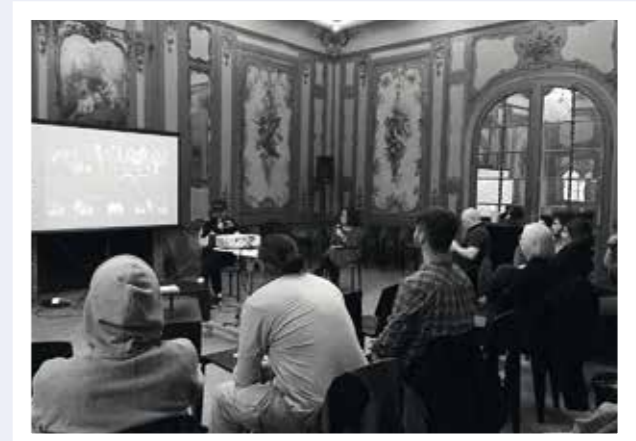
ETC Digital Theatre Workshop in Liège, 2019

ETC provides support for experimental digital projects by its member theatres and fosters international digital community-building and outreach through the live streaming of performances and conferences throughout the season.