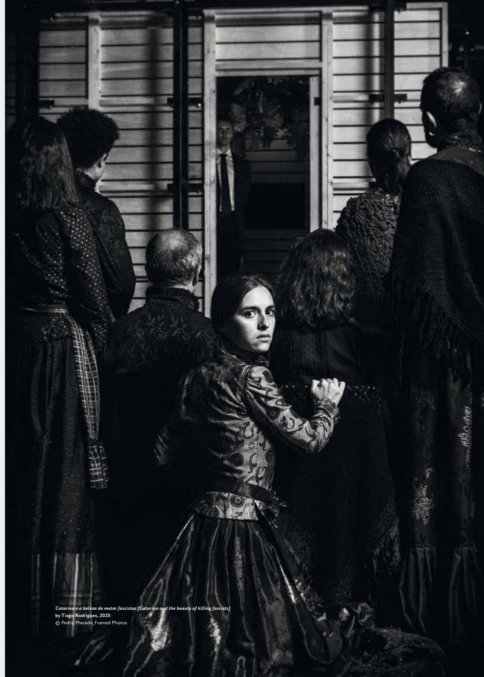
Catarina e a beleza de matar fascistas [Catarina and the beauty of killing fascists] by Tiago Rodrigues, 2020