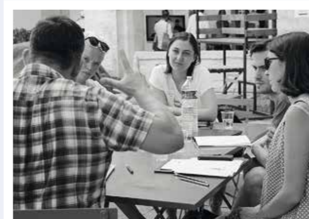
ETC European Theatre Academy in Avignon, 2019