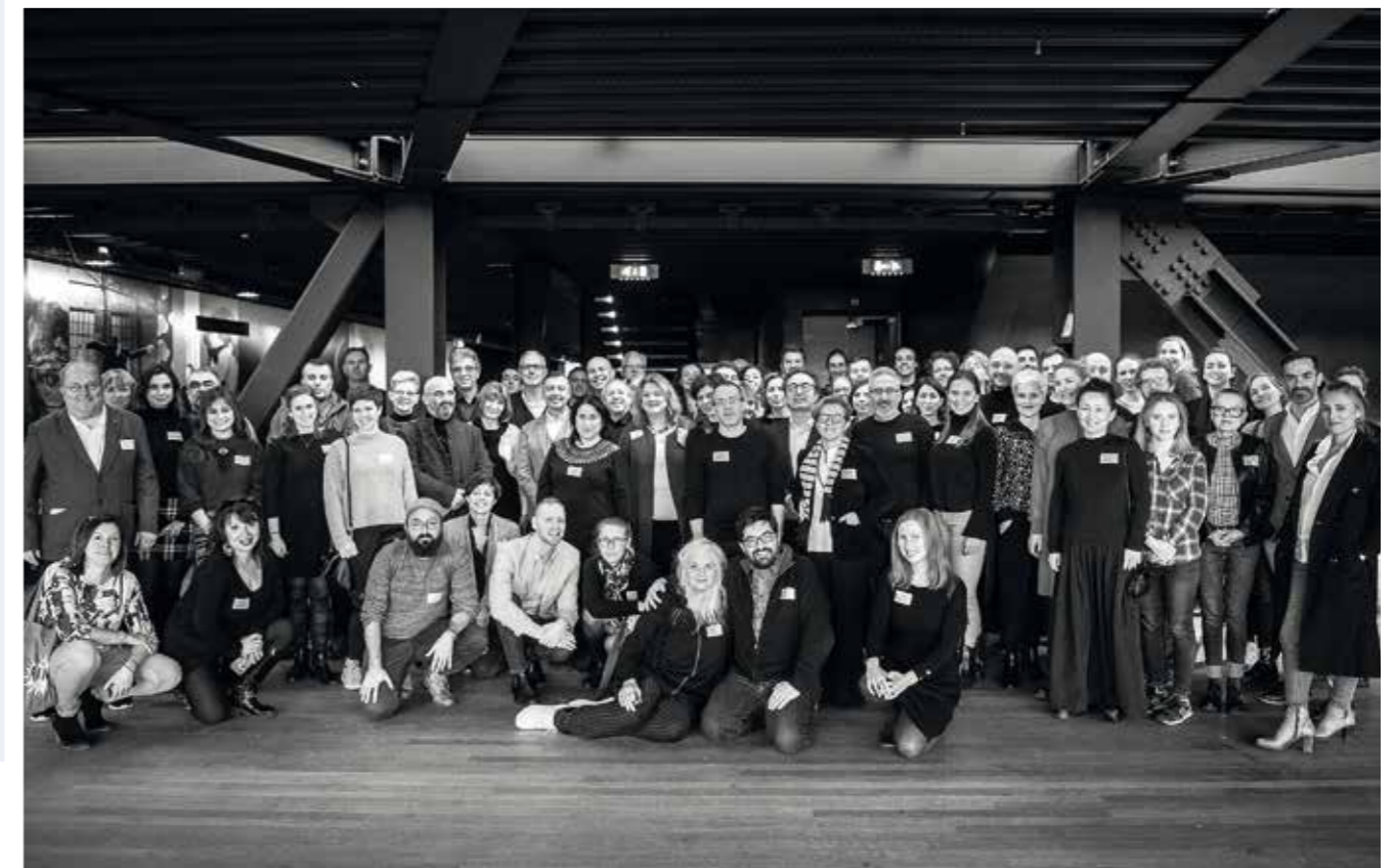
ETC International Theatre Conference in Amsterdam, 2019