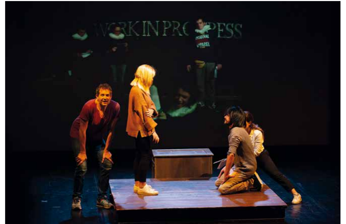
Lorca sogna Shakespeare in una notte di mezza estate (Lorca dreams of Shakespeare in a Midsummernight) , written and directed by Davide Carnevali

So it's not just a question of themes, but of the form in which certain themes are expressed. It is, therefore, a question of language. I'm not talking about word choice: I'm talking about a way of communicating that is fundamental for maintaining the interest of a spectator. It is necessary to find the delicate balance between a language that is mutually comprehensible, and a language that moves you, that amazes you, that opens up a world, that gives you an imaginative shock. The case with young people is striking, but it goes without saying that this isn't just about them. A theatre which wants to be useful at interpreting what is going on outside the theatre cannot speak in a language that is completely divorced from reality.