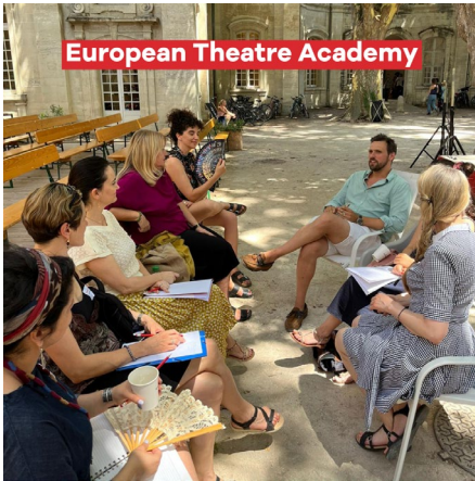
European Theatre Academy