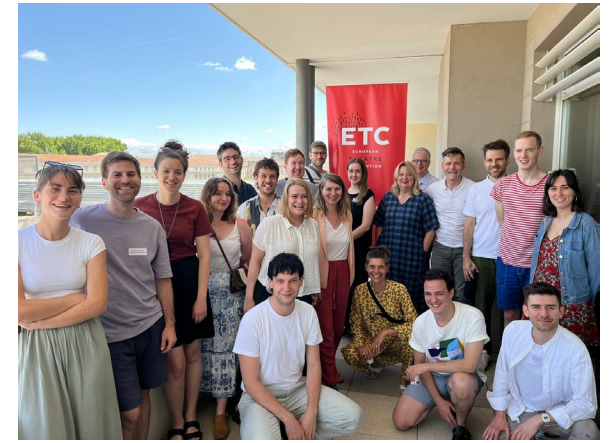
ETC Alumni Network