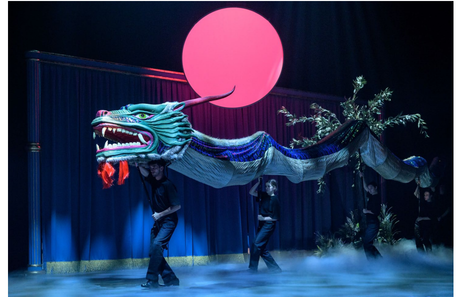
From 'One More Minute', a sustainable production by Národní divadlo – National Theatre Prague

ETC Contact: Laura Gardes lgardes@europeantheatre.eu