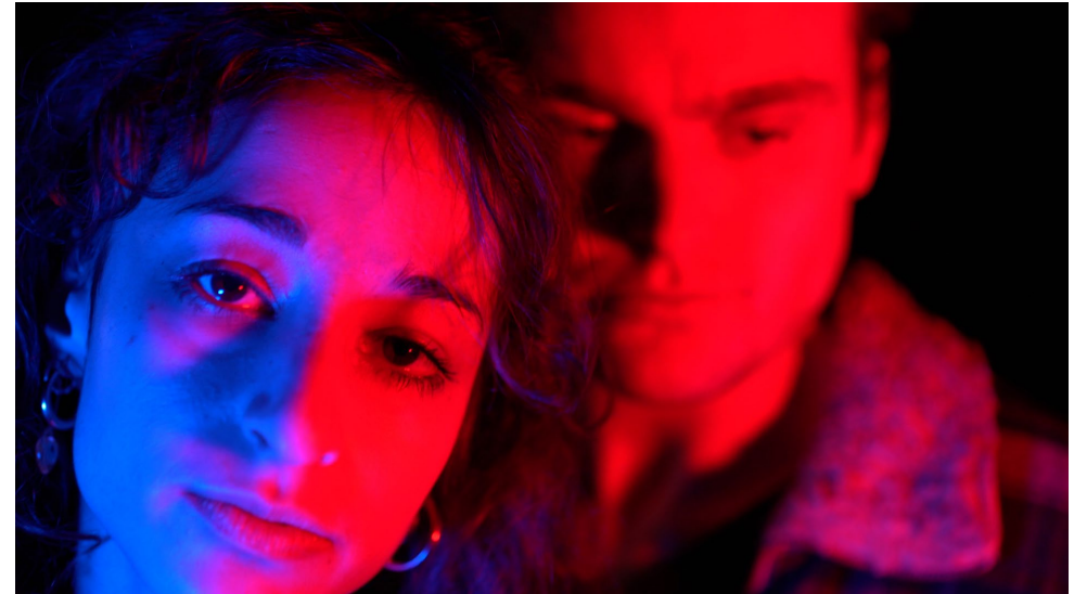
From 'Woyzeck', invited to Fast Forward Festival 2023